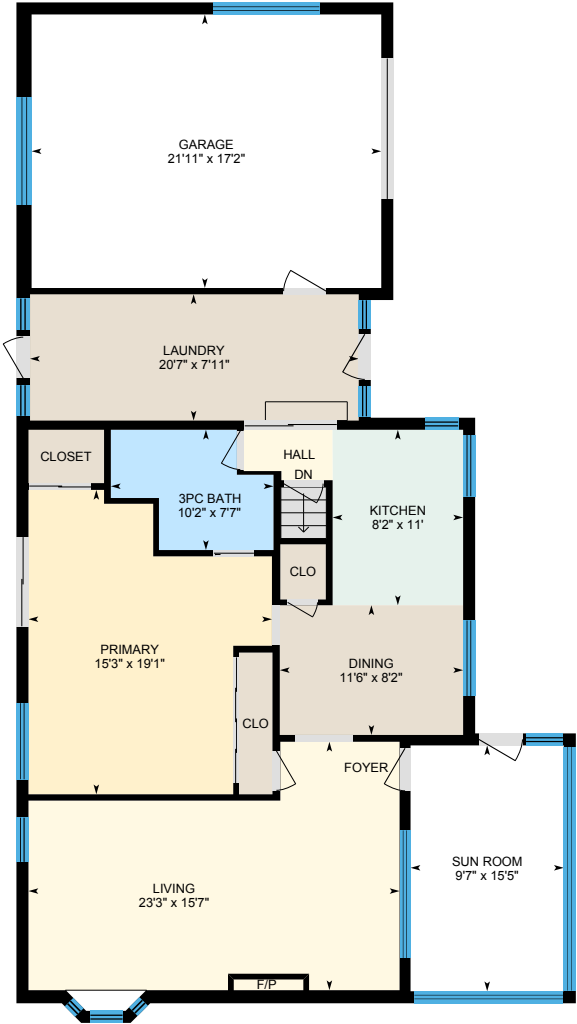
Main Floor Exterior Area 1170.10 sq ft

Main Building: Total Exterior Area Above Grade 1170.10 sq ft