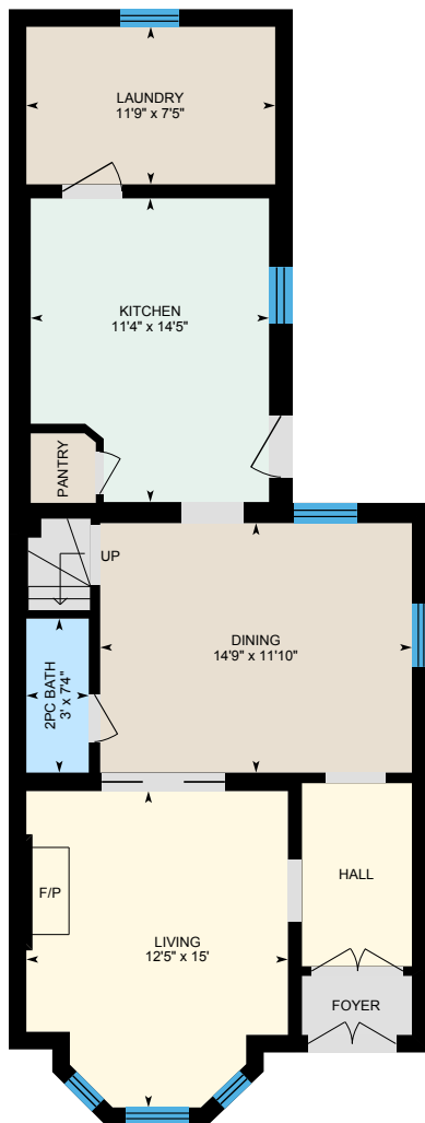
Main Floor Exterior Area 852.51 sq ft

Main Building: Total Exterior Area Above Grade 1370.25 sq ft