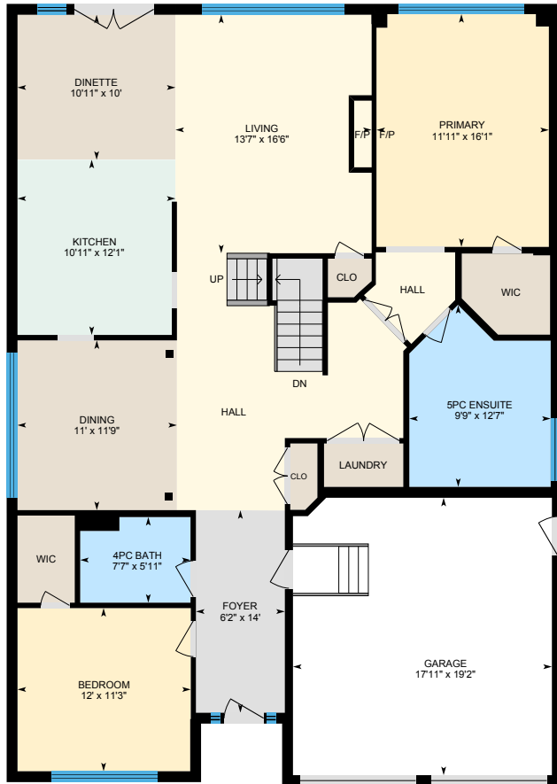
Main Floor Exterior Area 1672.45 sq ft

Main Building: Total Exterior Area Above Grade 2283.27 sq ft