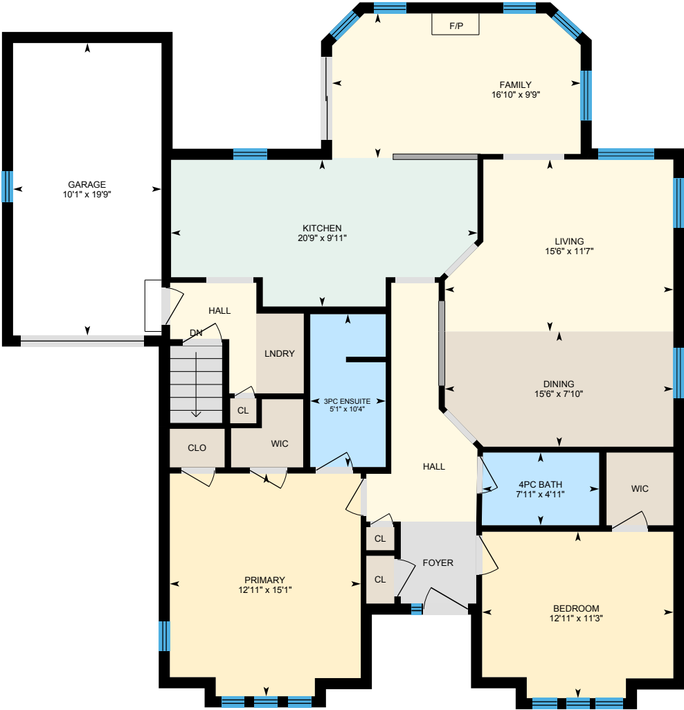
Main Floor Exterior Area 1458.62 sq ft

Main Building: Total Exterior Area Above Grade 1458.62 sq ft