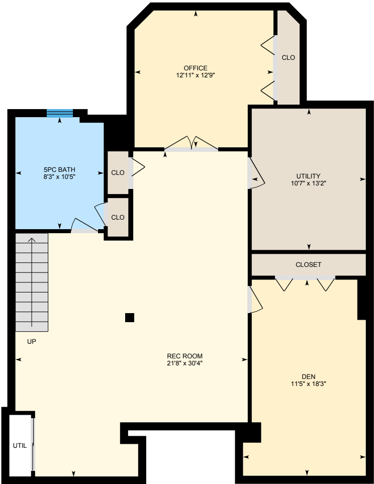
Basement (Below Grade) Exterior Area 1310.98 sq ft