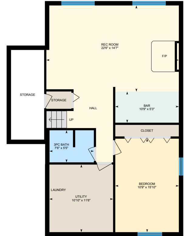
Lower Level (Below Grade) Exterior Area 961.53 sq ft