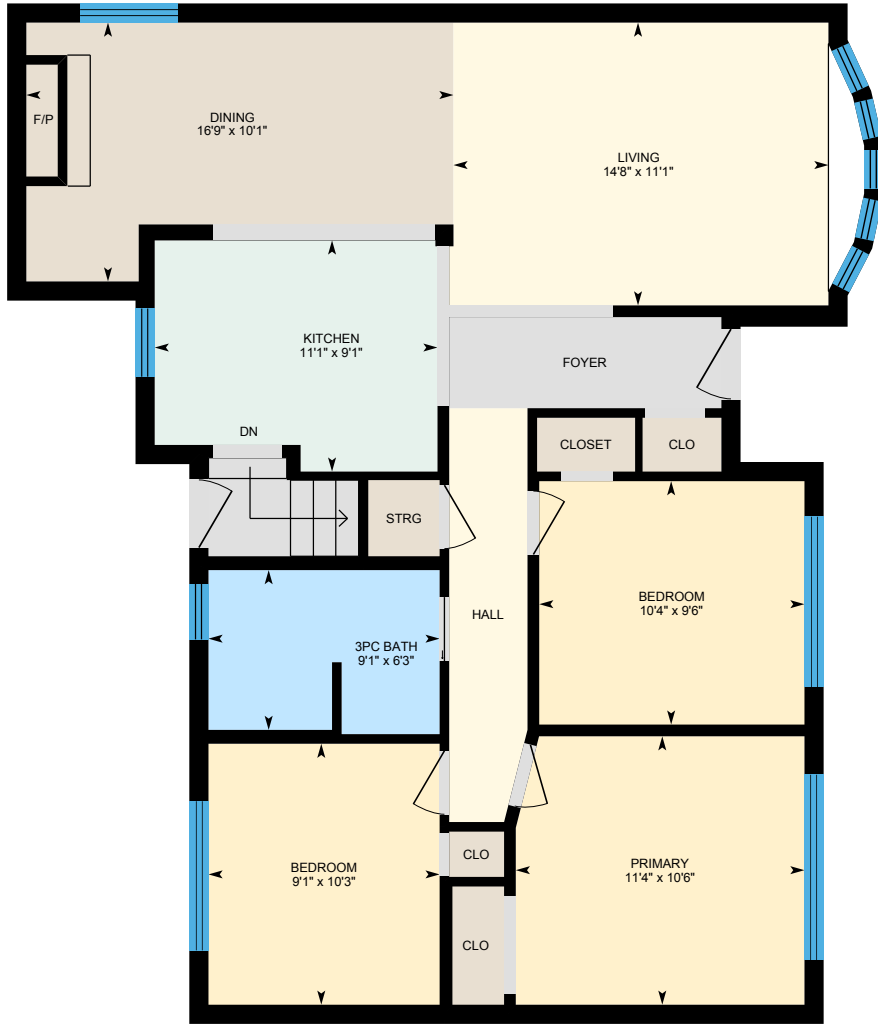
Main Floor Exterior Area 1081.75 sq ft

Main Building: Total Exterior Area Above Grade 1081.75 sq ft